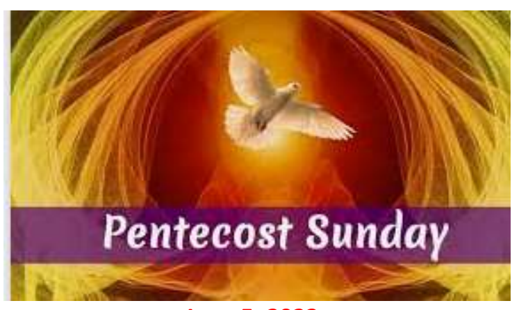
June 5, 2022 Don't forget to wear Red!