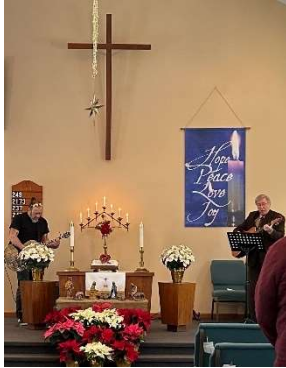
Christmas Morning service