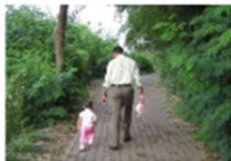
"Children Will Listen"